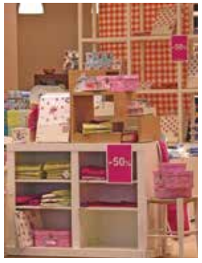
Cafeterias / Discount Stores