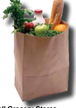
Convenience Stores / Small Grocery Stores