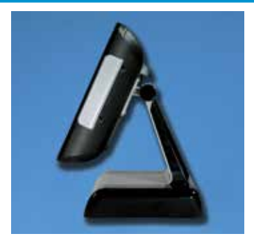
Sleek Cabinet Design