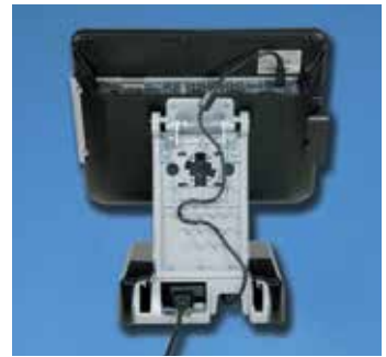
Integrated Power Supply and Cable Management Keeps Cords Hidden and Organized