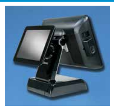
Optional Integrated 9.7" Rear LCD Customer Display